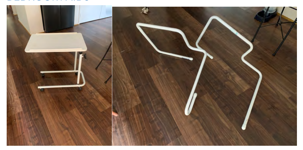
Adjustable Table and Bed Support bars